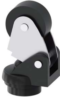
Actuator head for position switch 3SE51 Roller lever Stainless steel lever and Plastic roller 22 mm