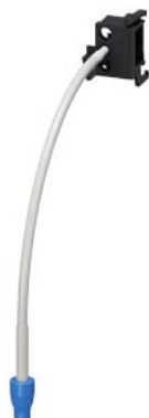
Cable release for reset 0.4 m for 3RU2 Size S00...S3