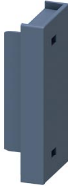
Touch protection for power bus for ET 200SP motor starter Bag containing 10 units