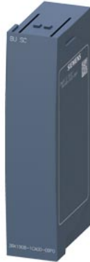
BU cover 30 mm for ET 200SP motor starter for protection of empty slots