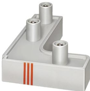
15 mm power bus jumper L123 for ET 200S