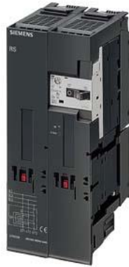
RS1-X for ET 200S Standard reversing starter expandable Setting range 5.5...8 A AC-3, 3 kW / 400 V Electromechanical starter for brake control module