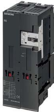
RS1-X for ET 200S Standard reversing starter expandable Setting range 4.5...6.3 A AC-3, 2.2 kW / 400 V Electromechanical starter for brake control module