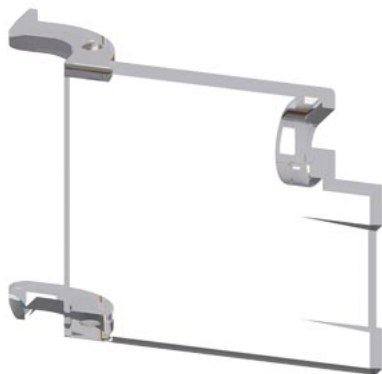
Sealable cover cap for 3RF29 function modules except converter