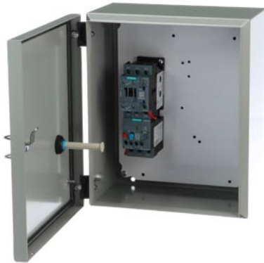
STARTER, 3RE41227CA354VY0, WITH MODS