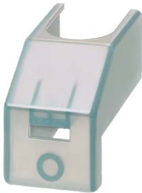
Terminal cover, 1-pole, for 100 A and 125 A, accessory for Main and emergency switching-off switch 3LD2