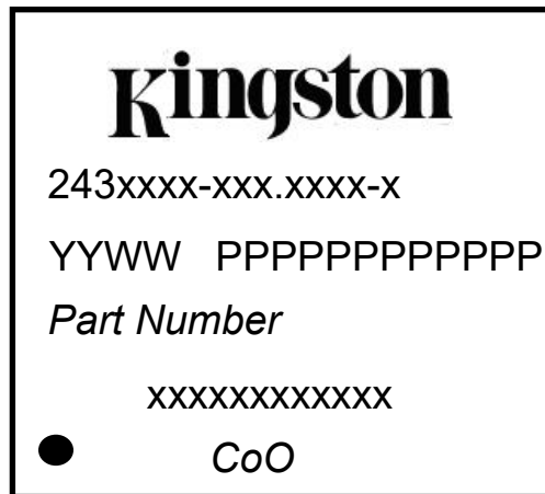
Figure 4 - EMMC Package Marking