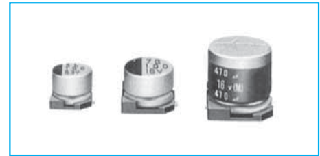
Marking color : Black print (except height : 10mm) White print on a brown sleeve ( \phi 8 \times 10L, \phi 10 \times 10L )