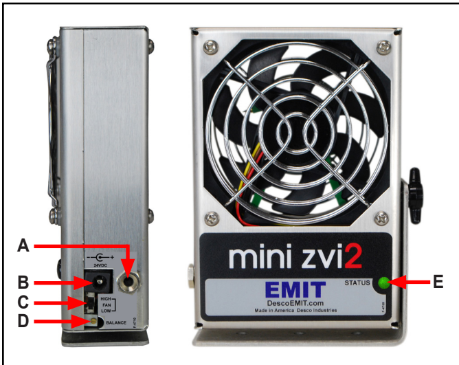
Figure 3. Mini Zero Volt Ionizer 2 features and components

A. Ground Jack: Insert the banana plug end of the included ground cord to this jack. Connect the ring terminal end of the cord to equipment ground.