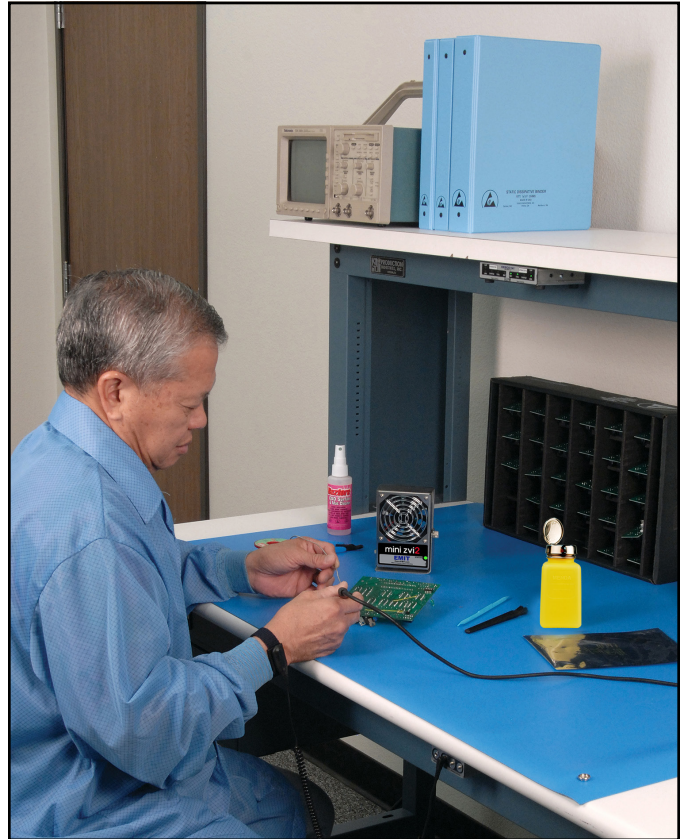
Figure 4. Using the Mini Zero Volt Ionizer 2 at a workstation.