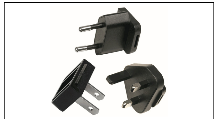
Figure 2. Interchangeable power adapter plugs included with the Mini Zero Volt Ionizer 2