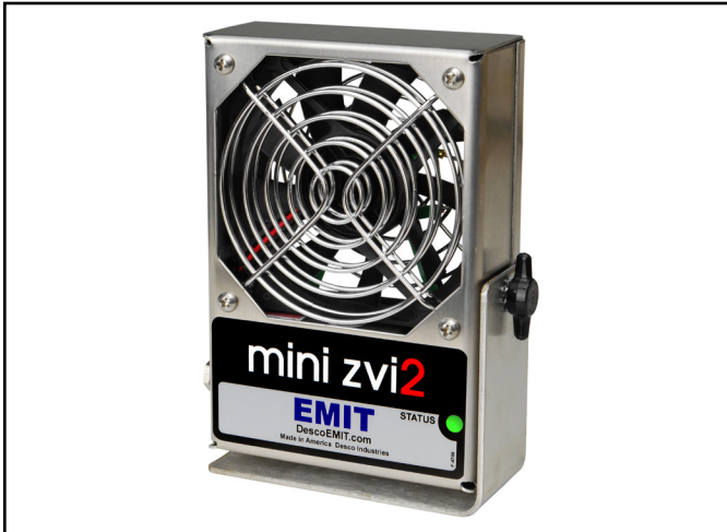
Figure 1. EMIT 50642 Mini Zero Volt Ionizer 2