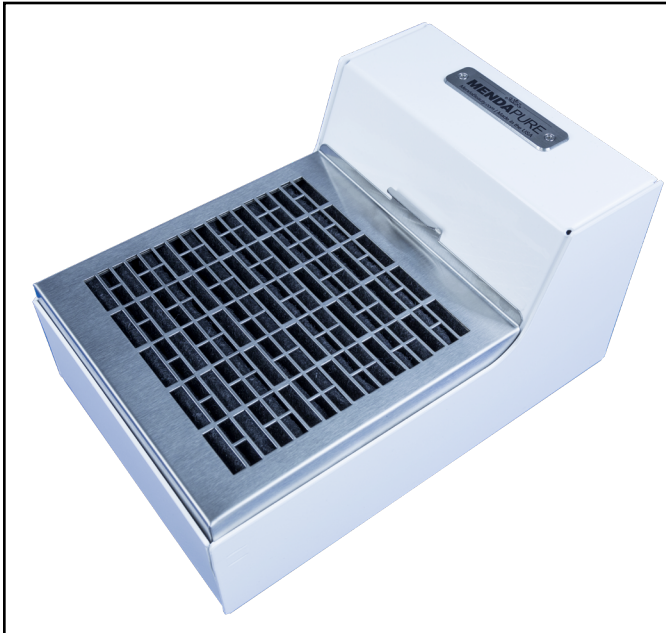
Figure 1. 35976 MendaPure Nail Dust Collector

The MendaPure Nail Dust Collector and its accessories are available as the following item numbers: