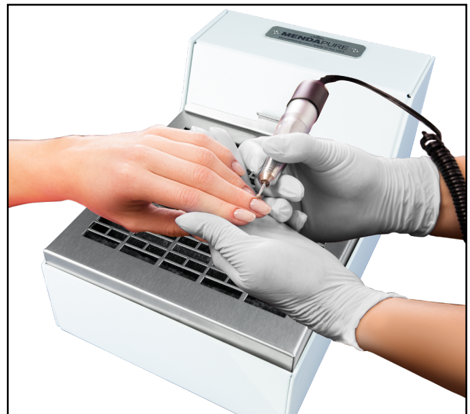
Figure 3. Using the MendaPure Nail Dust Collector