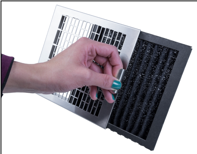
Figure 5. Removing a dirty carbon filter from the filter grille