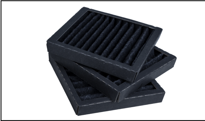
Figure 4. Replacement carbon filters for the MendaPure Nail Dust Collector