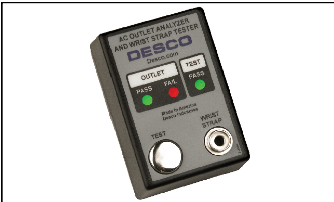
Figure 2. Desco 98131 AC Outlet Analyzer and Wrist Strap Tester

Use the AC Outlet Analyzer and Wrist Strap Tester to fulfill the S6.1 Section 6.3.1 requirement. “The hot, neutral, and equipment grounding conductor shall be verified to be in the proper wiring orientation in accordance with the National Electric Code (ANSI/NFPA-70).” (Grounding ANSI/ESD S6.1 section 6.3.1 Equipment Grounding Conductor)