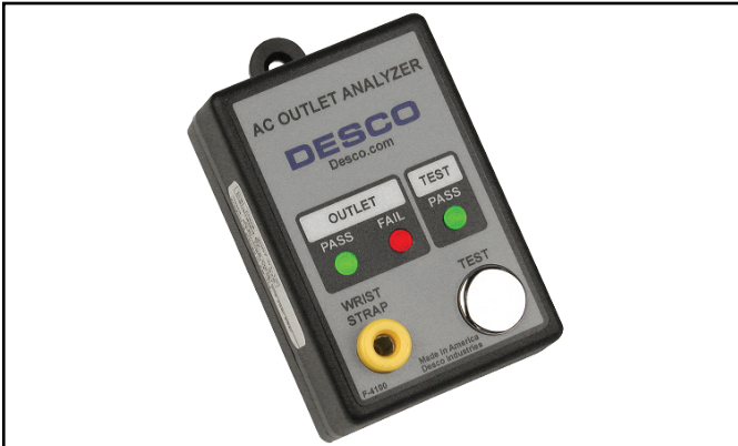
Figure 1. Desco 98132 AC Outlet Analyzer and Wrist Strap Tester