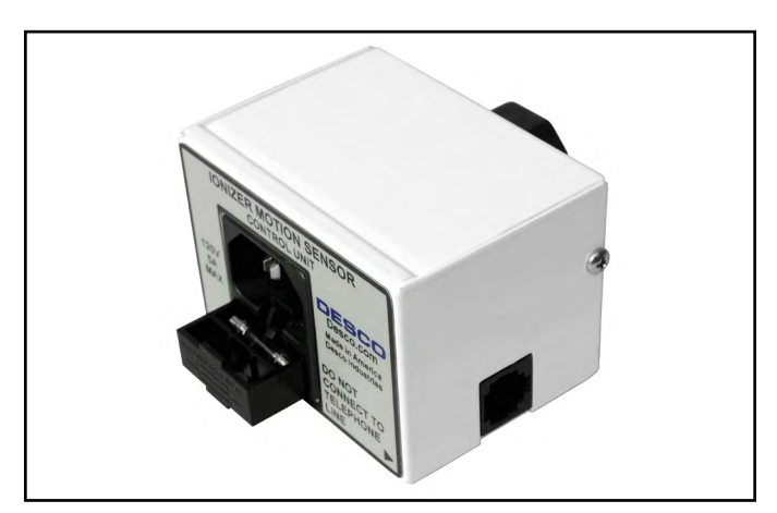
Figure 6. Replacing the fuse in the Control Unit

The fuse located in the Control Unit may be replaced by removing the power cord and opening the fuse drawer at the IEC inlet. The Control Unit uses one 5A, 250V slow blow fuse. DO NOT use other ratings as it may pose a safety hazard.