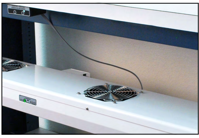
Figure 5. Using the Ionizer Motion Sensor with the 60473 Chargebuster® 3-Fan Overhead Ionizer