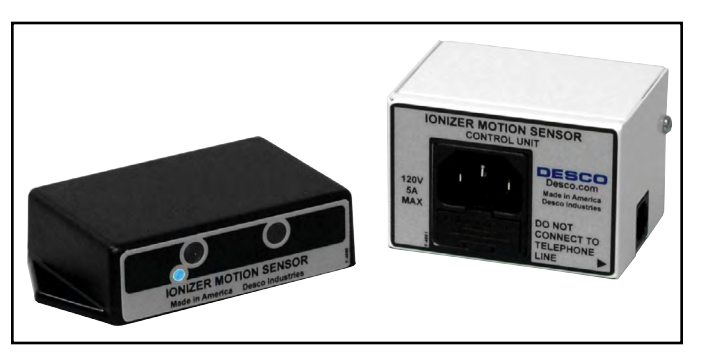
Figure 1. Desco 60509 Ionizer Motion Sensor