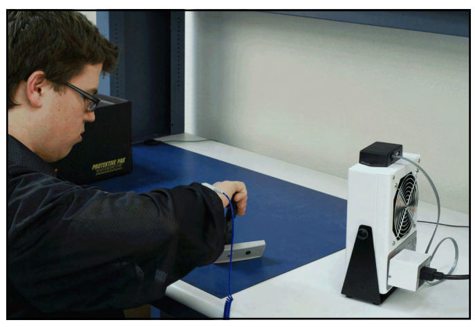
Figure 4. Using the Ionizer Motion Sensor with the 60505 High Output Benchtop Ionizer

Leave the sensor's field of view to activate the shutoff delay timer. The Ionizer Motion Sensor's LED will turn off and unpower the ionizer once the preset deactivation delay time is reached.