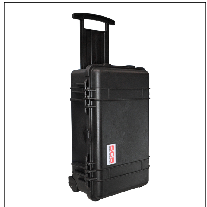
Figure 3. Extendable handle on the carrying case