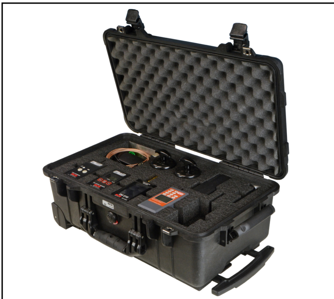
Figure 2. SCS 752 EOS/ESD Audit Kit, Premium