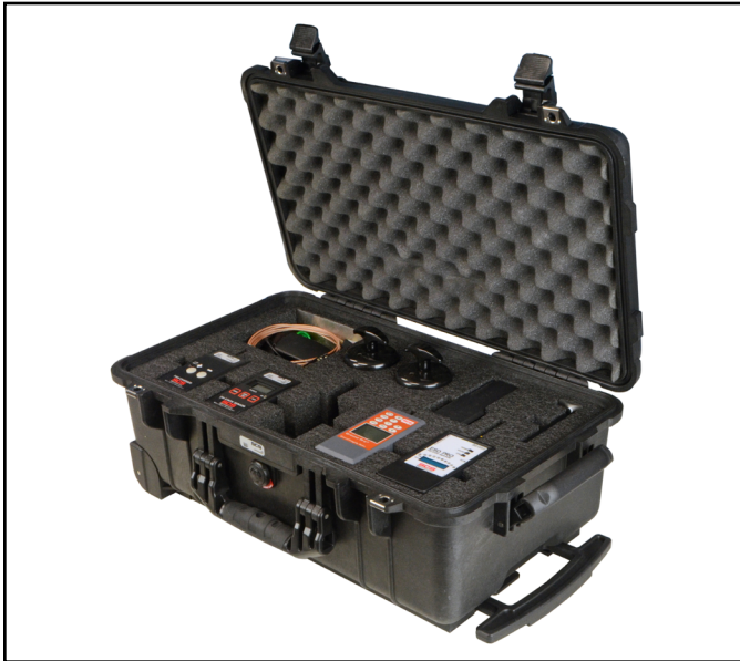
Figure 1. SCS 751 EOS/ESD Audit Kit, Standard