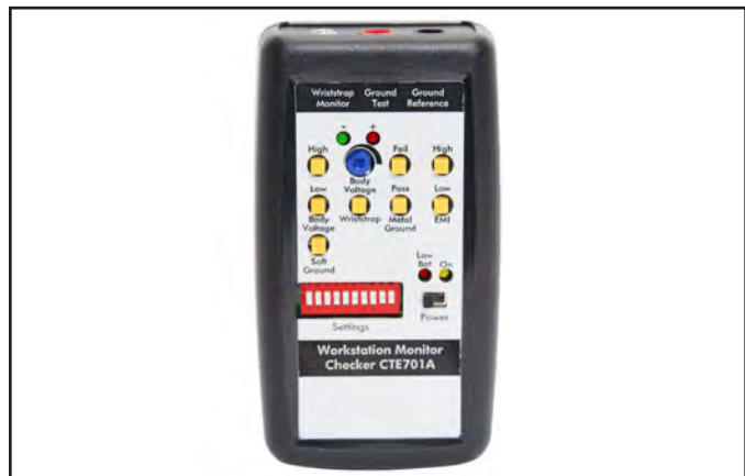
Figure 3. SCS CTE701 Workstation Monitor Checker

The checker verifies the proper operation of dual wrist strap monitoring. Connect a 3.5 mm test cable to both the checker and to the operator jack of the monitor. At this point the monitor should indicate failure. Depress the Pass button on the wrist strap section. The monitor should indicate a good connection. While pressing the Pass button, press body voltage “high.” At this point the Wrist Strap LED would be blinking red.