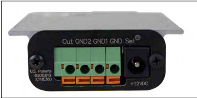
Figure 2. Rear view of Wrist Strap and Ground Monitor