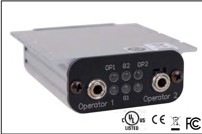
Figure 1. SCS 773 Wrist Strap and Ground Monitor