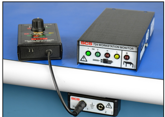
Figure 3. Using the Verification Tester with the 724 Workstation Monitor