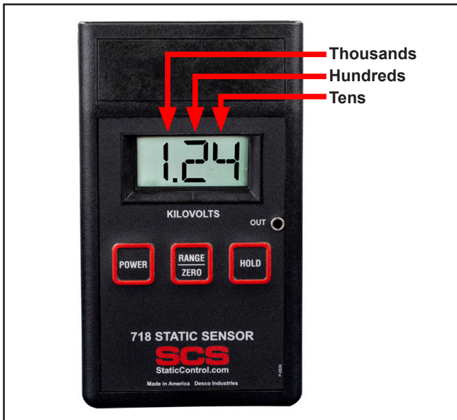
Figure 3. Reading the Static Sensor while in the \pm 20 kV range