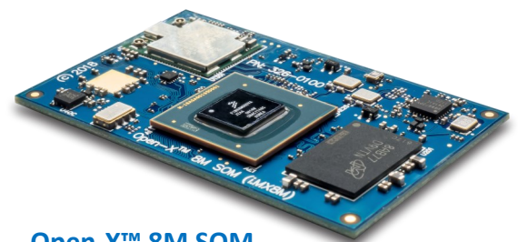
Open-X™ 8M SOM