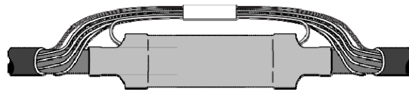
5417A-WG and 5418A-WG