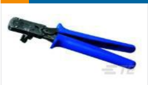
TE Part #169480-1 HAND TOOL(IEC COSI)