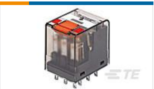
TE Part #2-1415045-1 PT571220