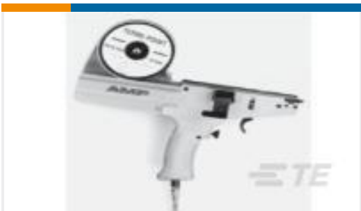
TE Part #69561-4 MANDREL ASSY, 69702