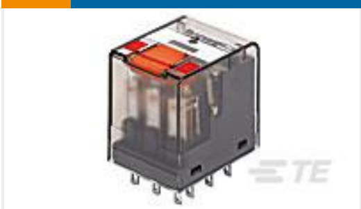
TE Part #7-1415541-0 PT570LC4