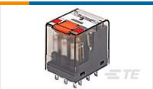
TE Part #7-1419111-9 PT570006