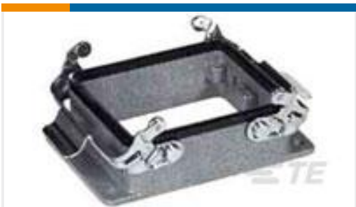
TE Part #1-1102352-1 HB.32.AG-VS