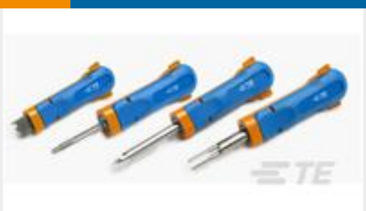
TE Part #1579008-5 EXTRACTION TOOL