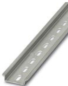
DIN rail, Length: 2000 mm

Please be informed that the data shown in this PDF Document is generated from our Online Catalog. Please find the complete data in the user's documentation. Our General Terms of Use for Downloads are valid ( http://phoenixcontact.com/download )